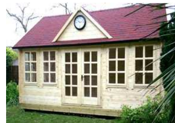
New club hut design

The new club hut is on order and is due to be delivered on Monday 28 th March. Design will be similar to that pictured, although for security reasons the doors will be solid and all the windows will have shutters. Contractors will be on site on Friday 25 th March to dismantle the existing hut in preparation for the new one arriving.