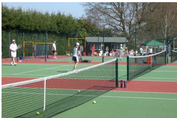
A game with potential new members

For the past five years, we have held an Open Day at the start of the season. This has been our most successful method of attracting new members to join the club. This year, the Open Day will be held on Sunday May 15 th , from 11:00 to 15:00. This is a month later than usual due to the work involved in replacing the Club Hut.