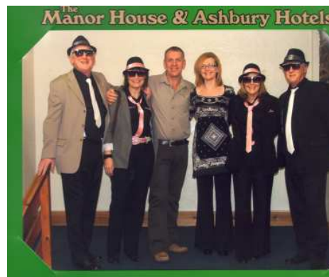
2011 SLTC group at Manor House

For most of the above activities, there are organised sessions or competitions (free of charge).