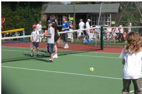
Helping the Juniors

It is particularly important that we have a wide range of members (representing all abilities and age groups) there on the day so that potential new members can join in a game and see the club in its best light.