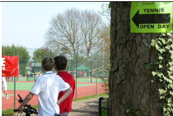
Come along and join in!

Please encourage anyone you know who may be interested in playing tennis to come along, and help make it a fun-packed day. We would like to see as many members, friends and Sonning villagers as possible down at the club.