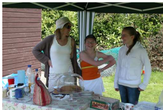
The refreshment stall

Please encourage anyone you know who may be interested in playing tennis to come along, and help make it a fun-packed day. We would like to see as many members, friends and Sonning villagers as possible down at the club.