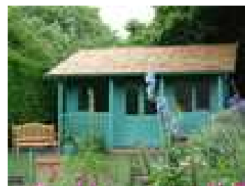
New club pavilion?

This project will be dependent on securing the necessary funding / grants via the Sonning Parish Council and King Georges Playing Field Association and, for the toilet, on the practicality/cost of connection to the main sewer.