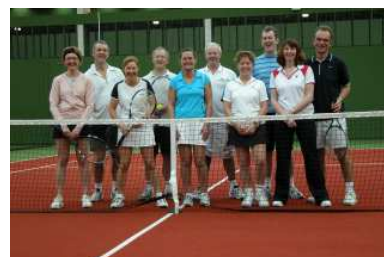
2008 SLTC group at Manor House