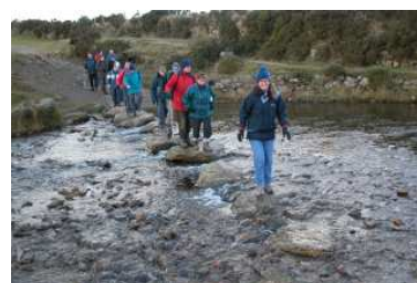
Guided walk on Dartmoor

For most of the above activities, there are organised sessions or competitions (free of charge).